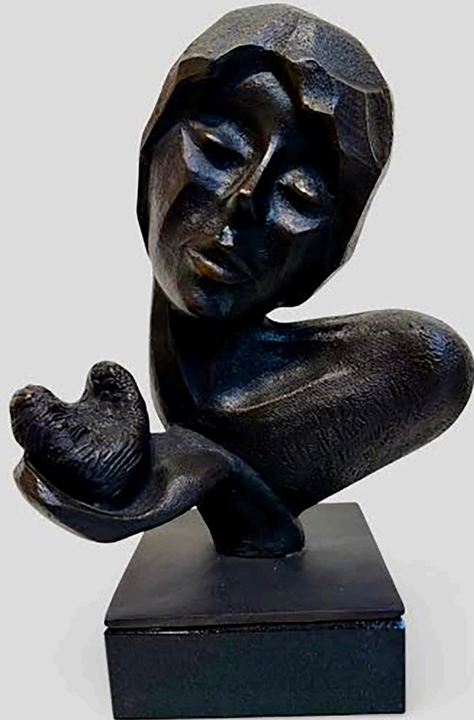
Grumbling vs. Gratitude: HEART CHOICES Original Artwork by Antje Campbell